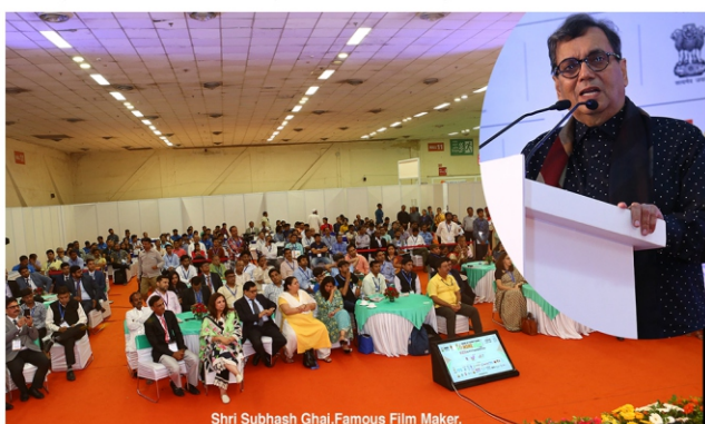
Shri Subhash Ghai, Famous Film Maker.