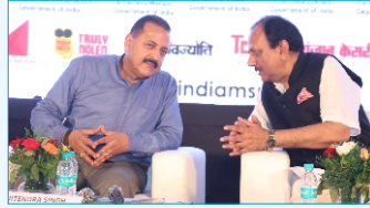
Dr. Jitender Singh Union Minister (MOS) Prime Ministers Office (PMO)