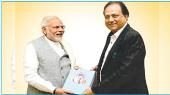
Sh. Narendra Modi Prime Minister of India