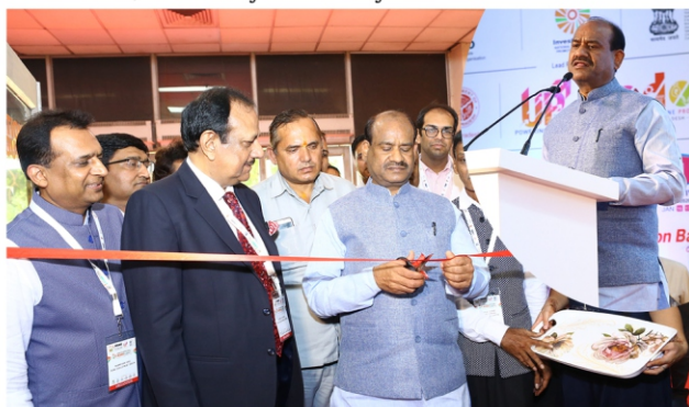
Sh. Om Birla, Speaker of Indian Parliament