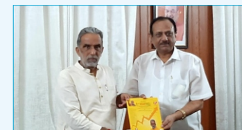
Shri Krishan Pal Gurjar, MOS-Heavy Industries & Public Enterprises & Power