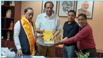
Sh. Narayan Rane, Union Minister of MSME