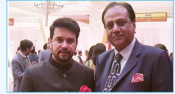
Sh. Anurag Thakur, Union Minister of I&B, Youth Affair & Sports