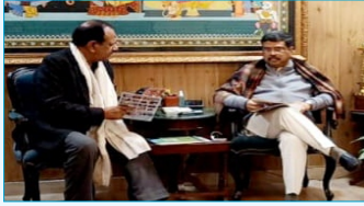
Sh. Dharmendra Pradhan, Union Minister of Education, Skill Development & Entrepreneurship