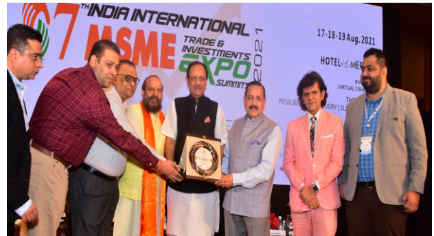
Dr. Jitender Singh Union Minister (MOS) Prime Ministers Office (PMO)