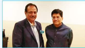
Sh. Piyush Goel, Union Minister of Commerce, Industry, Textiles & Consumer Affairs