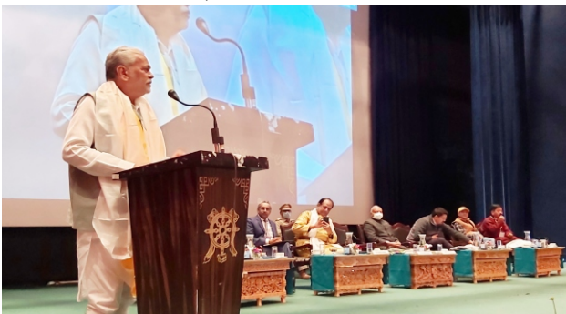
Sh. Parshottam Rupala, Minister of Fisheries, Animal Husbandry and Dairying