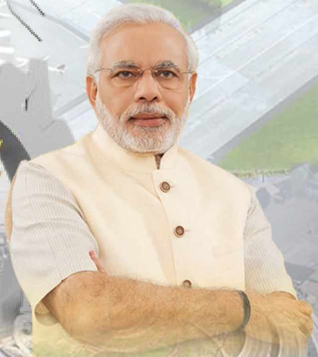
Shri Narendra Modi Hon'ble Prime Minister of India

B2G/B2B MEETS - NETWORKING NEW OPPORTUNITIES