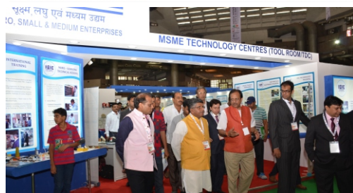
Shri Ravi Shankar Prasad, Union Electronic & IT Minister