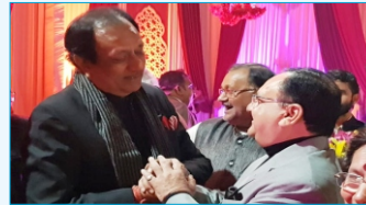
Sh. JP Naddha, President of Bhartiya Janta Party