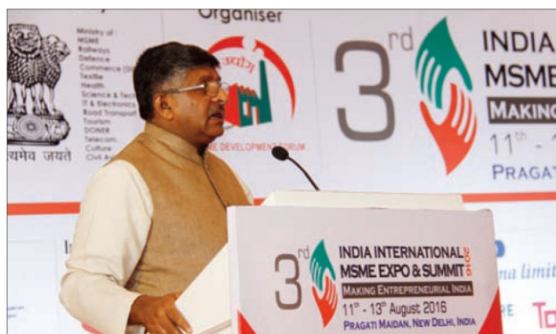
Sh. Ravi Shankar Prasad, Union Cabinet Minister for I.T, ITEs, Electronics & Law, deliberating on Ease of doing business policies & new opportunities in India