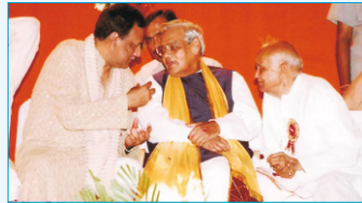
Sh. Atal Bihari Vajpayee Former Prime Minister of India