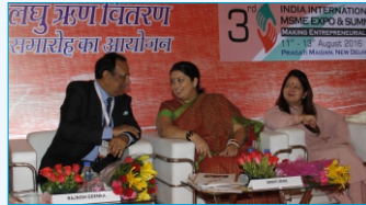
Smt. Smriti Irani, Minister of women & Child Development addressing the Expo-Summit