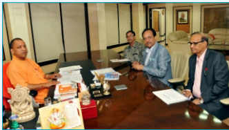
Sh. Yogi Adityanath, Chief minister of Uttar Pradesh