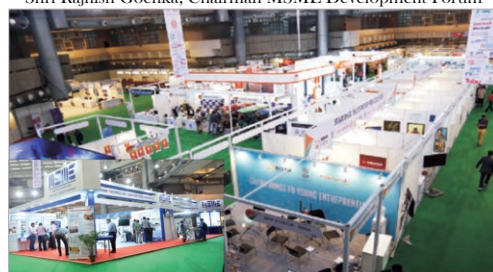
Arial View of MSME Expo - 2014