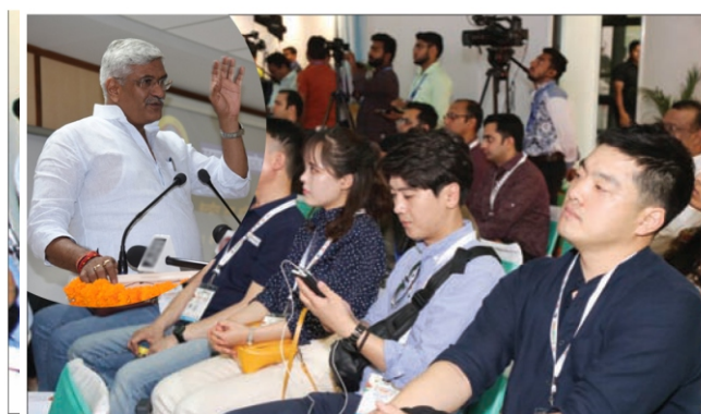
Sh. Gajendra Singh Shekhawat, Union Cabinet Minister of Jal Shakti (Water Resources) With Foreign Delegates, delivering Keynote address on opportunities in Water Resources Management in India