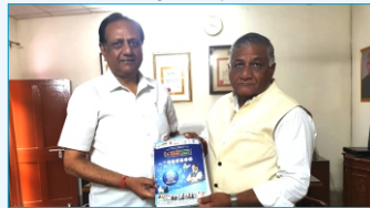
General Vijay Kumar Singh, Union Minister (MSO), Ministry of Road Transport and Highways