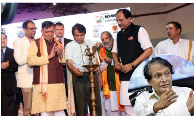
Sh. Suresh Prabhu, Union Minister of Railways, Commerce & Industry with Sh. Satish Mahana, Industry Minister, UP & Sh. Jai Bhagwan Goel Inaugurating 5th Expo