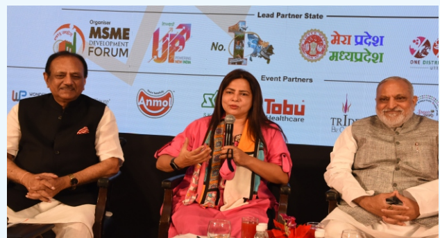
Smt. Meenakshi Lekhi, Minister of State for External Affairs and Culture