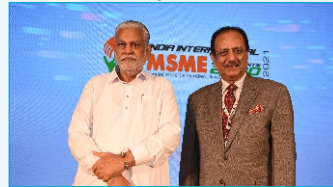
Sh. Parshotam Rupala Union Minister of Agriculture, Dairy and Fisheries