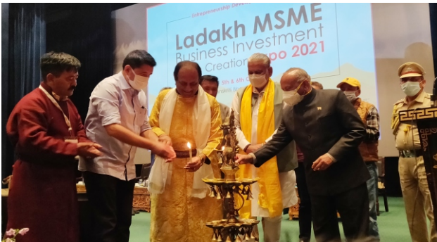
Sh. Parshottam Rupala, Minister of Fisheries, Animal Husbandry and Dairying Sh. R. K. Mathur, Lieutenant Governor of Ladakh