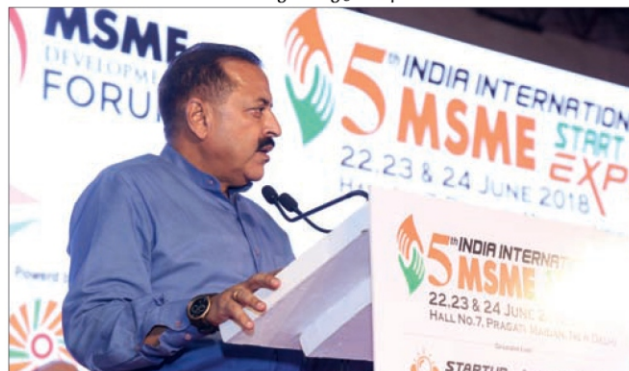
Dr. Jitender Singh, Union Minister (MSO) Prime Minister Office (PMO) & DONAR