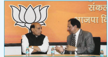
Sh. Rajnath Singh, Union Defence Minister