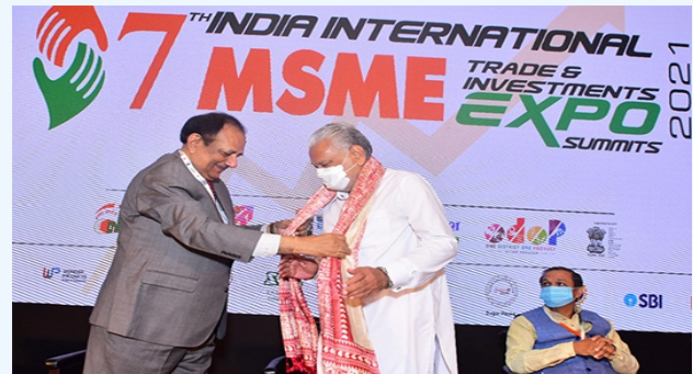
Shri Parshottam Rupala, Minister of Fisheries, Animal Husbandry and Dairying