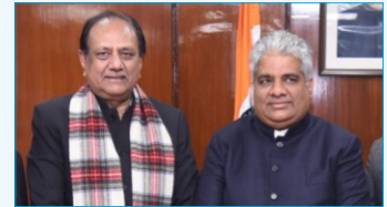
Sh. Bhupender Yadav Union Cabinet Minister for Environment, Forest & Climate Change; and Labour & Employment