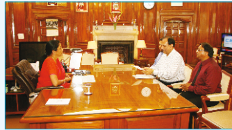
Smt. Nirmala Sitharaman, Union Finance Minister