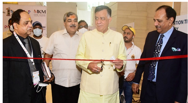
Sh. Satish Mahana, Industry Minister, U.P.