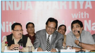
Sh. Nitin Gadkari, Union Minister of Road Transport & Highways