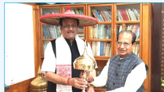
Sh. Jagdish Mukhi, Governor of Assam