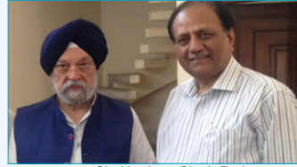
Sh. Hardeep Singh Puri Minister of Petroleum & Natural Gas, Housing & Urban Affairs